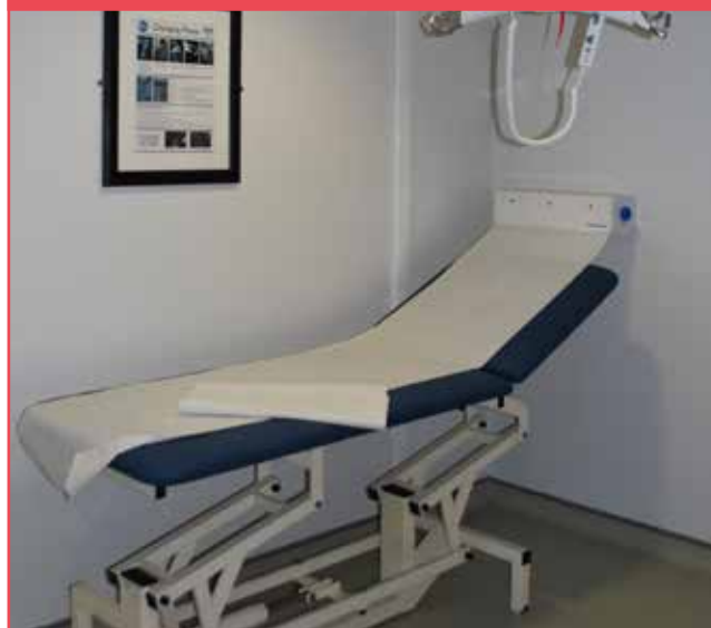
Equipment inside the new Changing Places facility

Changing Places toilets are different to standard accessible toilets (or "disabled