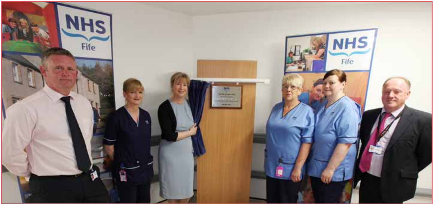
Shona Robison with staff members at the Day Surgery Unit

New Day Surgery and Urology units were officially opened by Shona Robison, Cabinet Secretary for Health, Wellbeing and Sport, at the end of May.