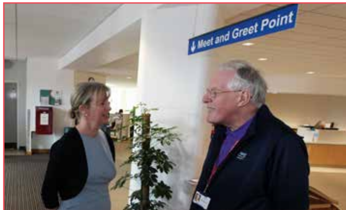
Above Shona Robison meets one of the Meet and Greet Volunteers

will also find copies of previous newsletters.