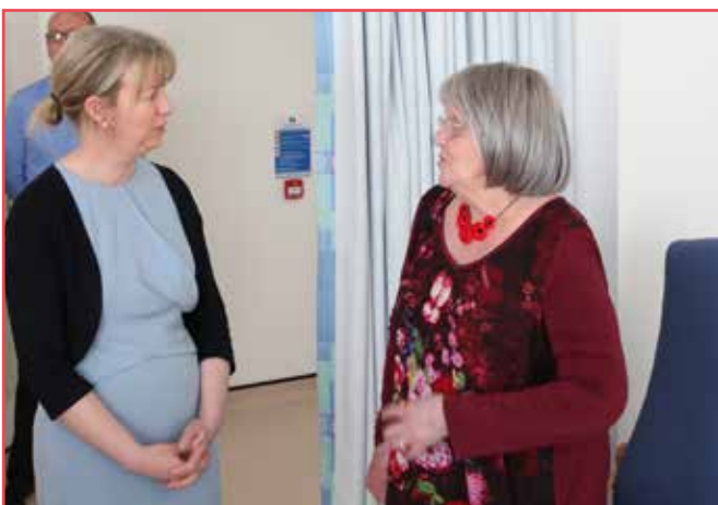
Shona Robison chats to a patient during her visit to the new Day Surgery Unit

Both the Day Surgery unit and the Urology unit are equipped with the latest specialist equipment, allowing NHS Fife to continue to provide an effective and efficient service in a bright and spacious environment."