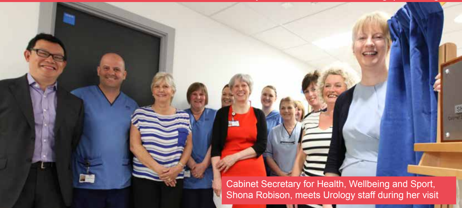
Cabinet Secretary for Health, Wellbeing and Sport, Shona Robison, meets Urology staff during her visit

Welcome to the latest edition of the Queen Margaret Development Project newsletter.