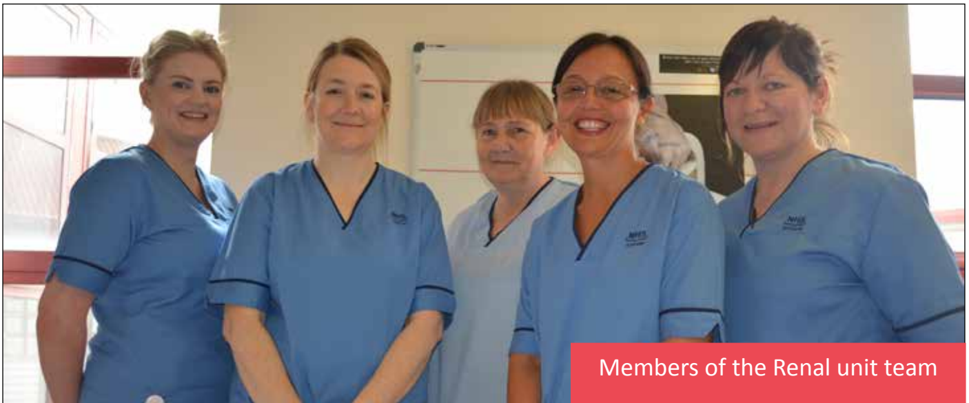
Members of the Renal unit team

Our 'In Focus' section takes a look at services on the Queen Margaret site, providing a further insight into activity. In this edition we look at the Renal unit.